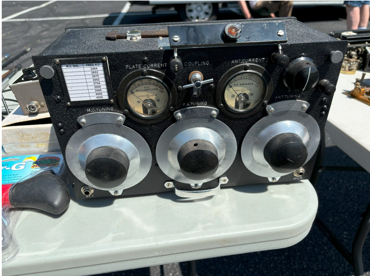
An old U.S. Coast Guard T-22 MOPA 5W AM transmitter from around 1932. The matching CGR-22 TRF receiver formed a portable station for 2.4-4MHz.