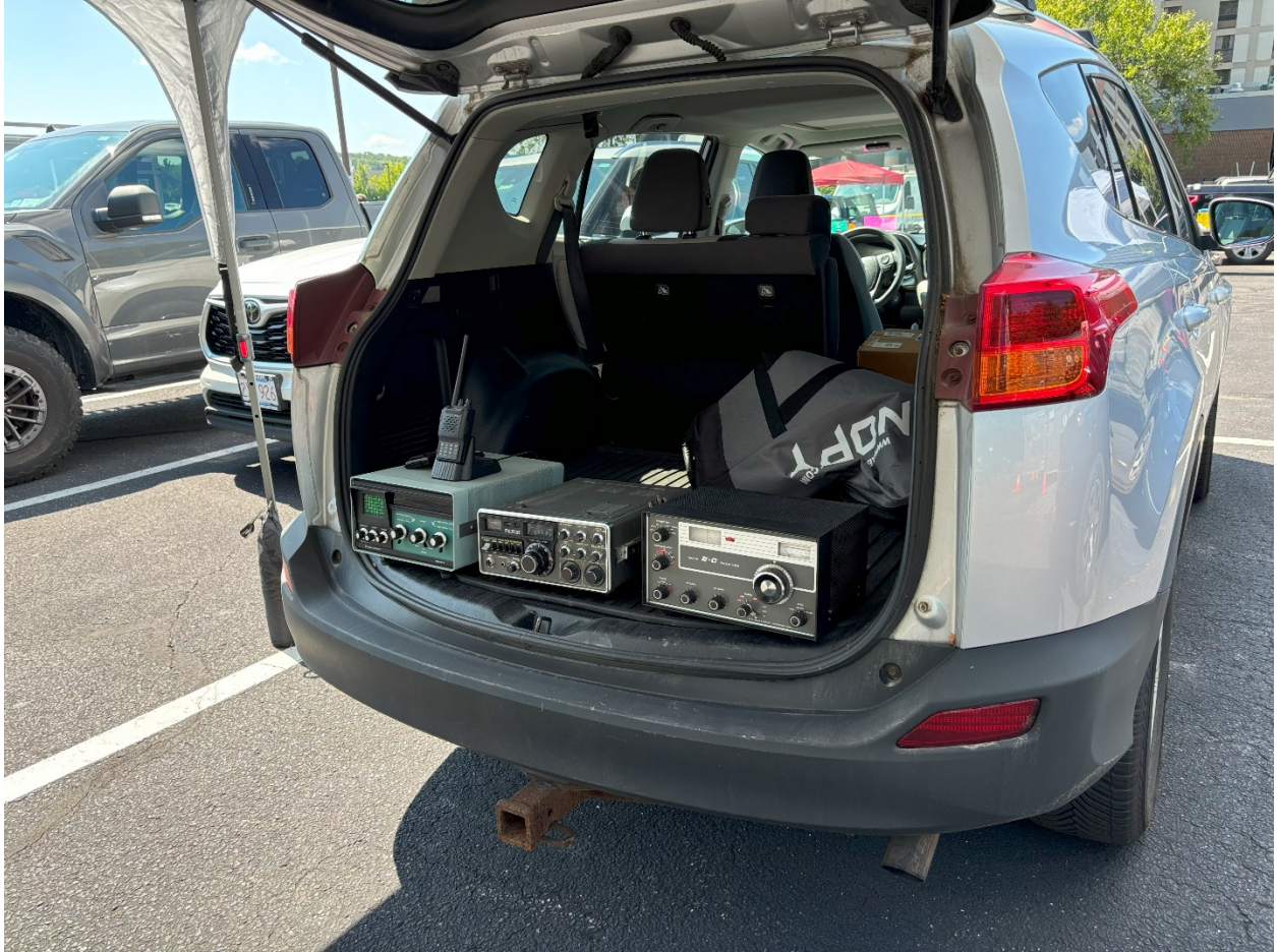
Tailgating...not for a football game but to sell some classic radios!