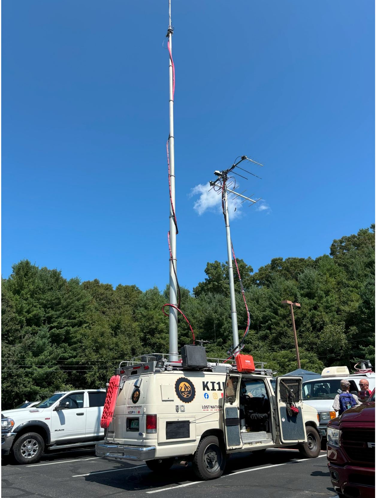
The Lost Nation remote van.