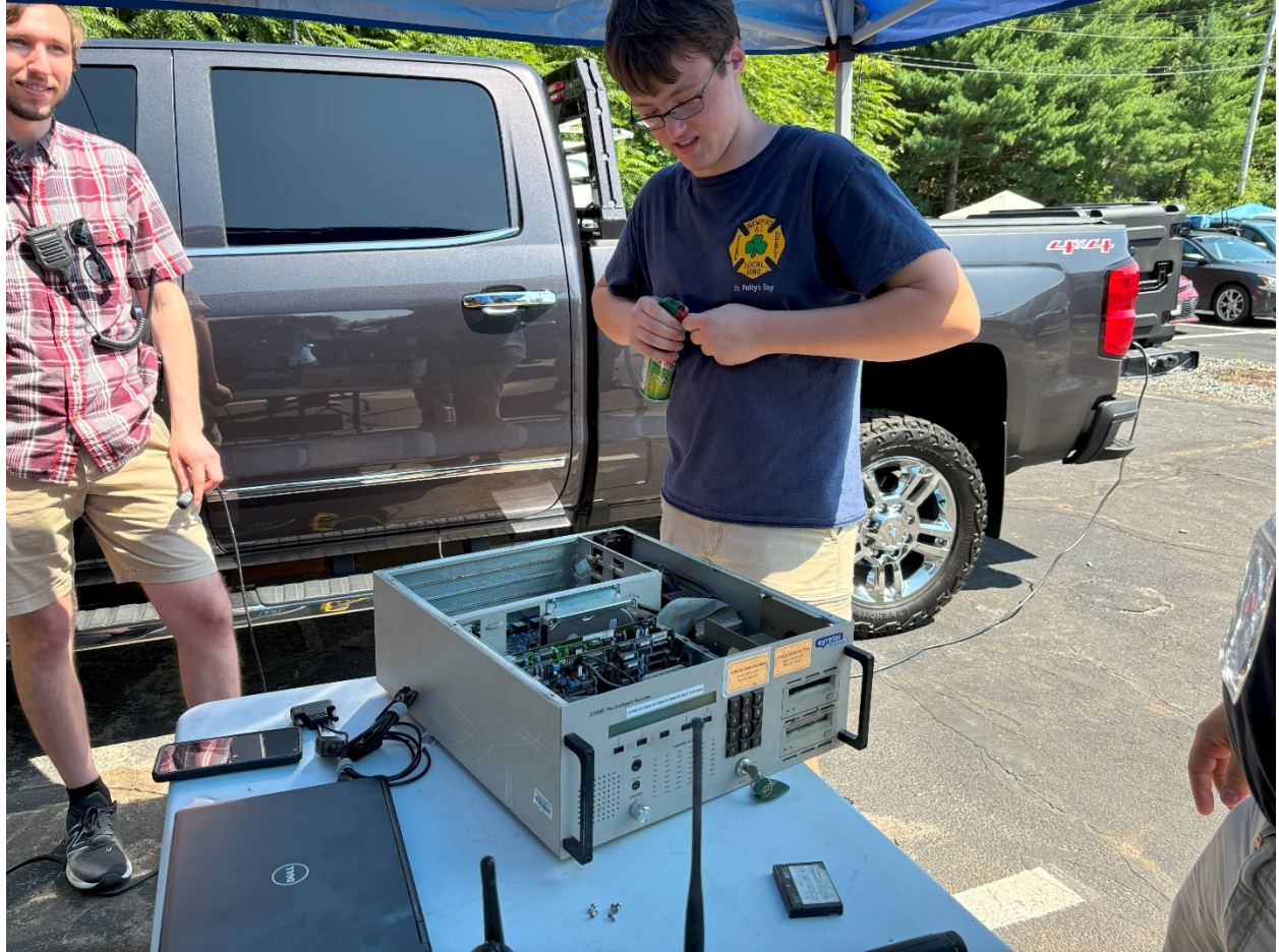
Some smart young hams work on DMR radios.